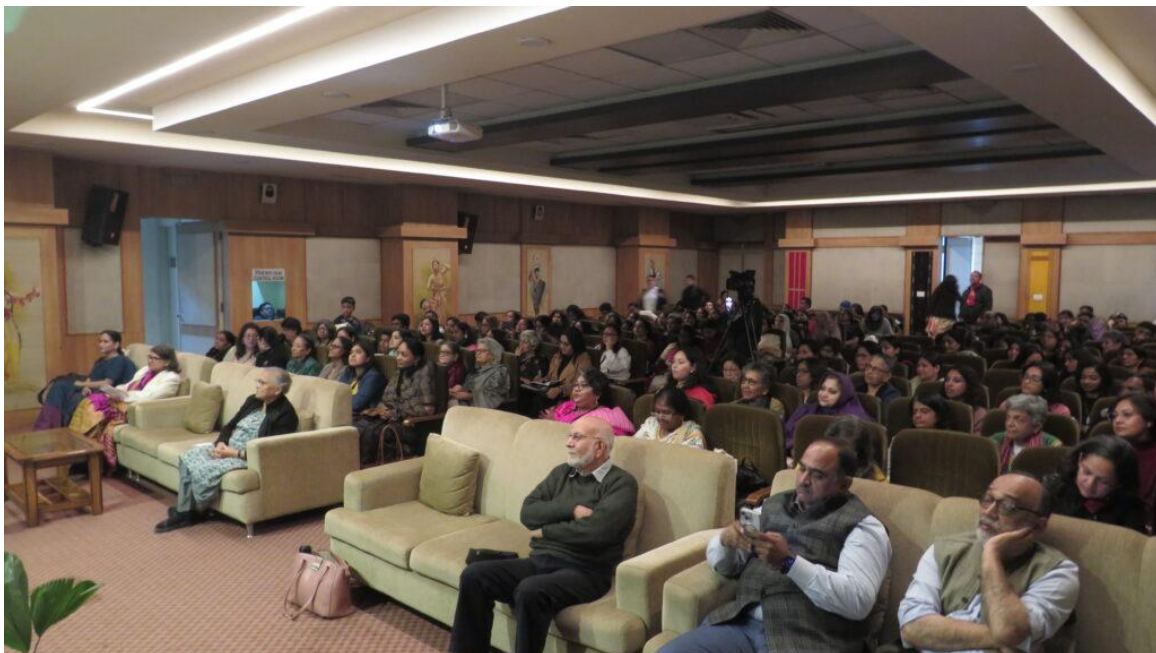
NWMI members and audience at the public meeting

Speaking of the impact of climate change, she said the incidence of agricultural pests has gone up in the region. Seeds are not germinating, and there’s water scarcity, leading to a decrease in agricultural productivity. All this has led to loss of livelihoods. “When livelihood goes, women are subjected to abuse,” she said.