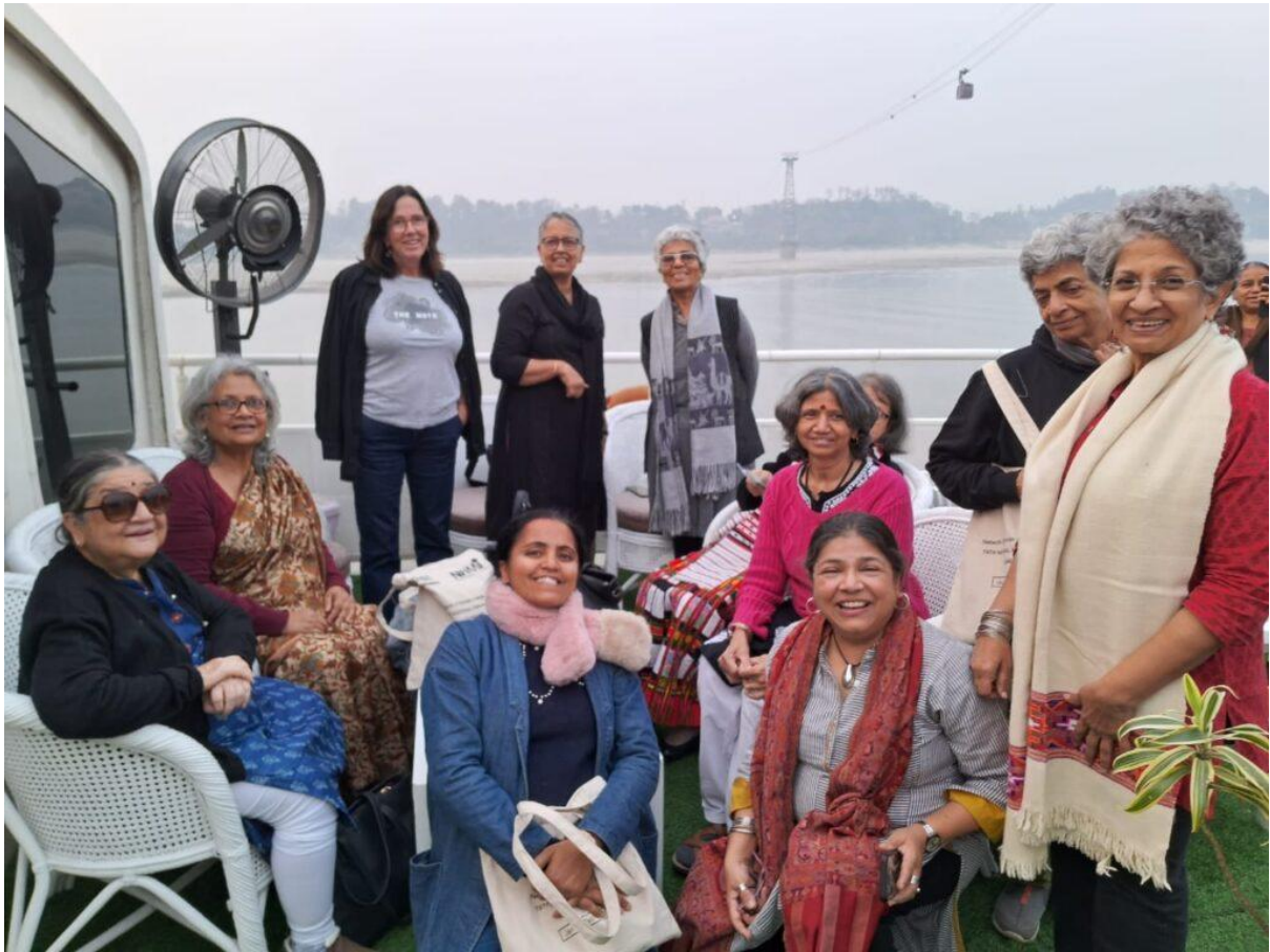
NWMI members on the Brahmaputra cruise

Members took some time out after the meeting to cruise along the Brahmaputra, which was a significant presence outside our meeting halls at the Don Bosco Institute.